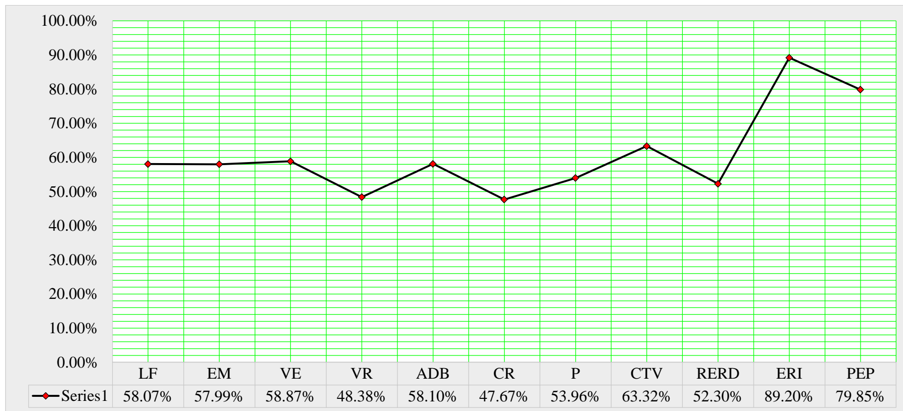
FIGURE 2: CUMMULATIVE RATINGS OF STEPS IN NIGERIA'S PRESIDENTIAL ELECTION ADMINISTRATION PROCESS (1999-2011)