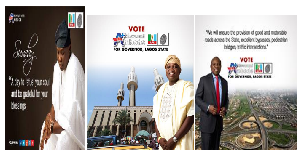
Text 3: Poster and billboard ads