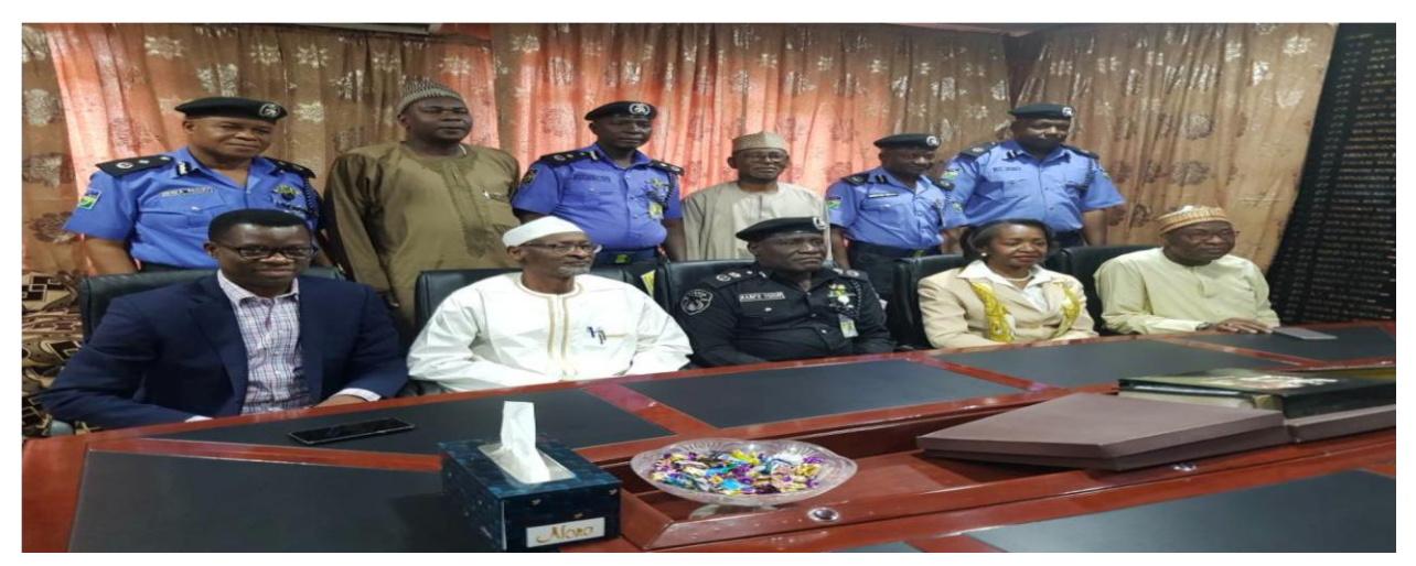
The Committee members with the Kano State Commissioner of Police