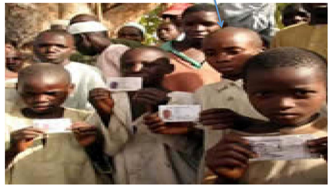
The above picture is not from the current Continuous Voter Registration exercise. It was published three years earlier. See Nairaland, March 07, 2015 <a href="http://www.nairaland.com/2183375/issue-underage-voting-should-blame">http://www.nairaland.com/2183375/issue-underage-voting-should-blame</a>

Further analysis of the Card that persons shown in the above picture were carrying when compared to the Temporary Voters Card (TVCs) currently issued by the Commission reveals the following: