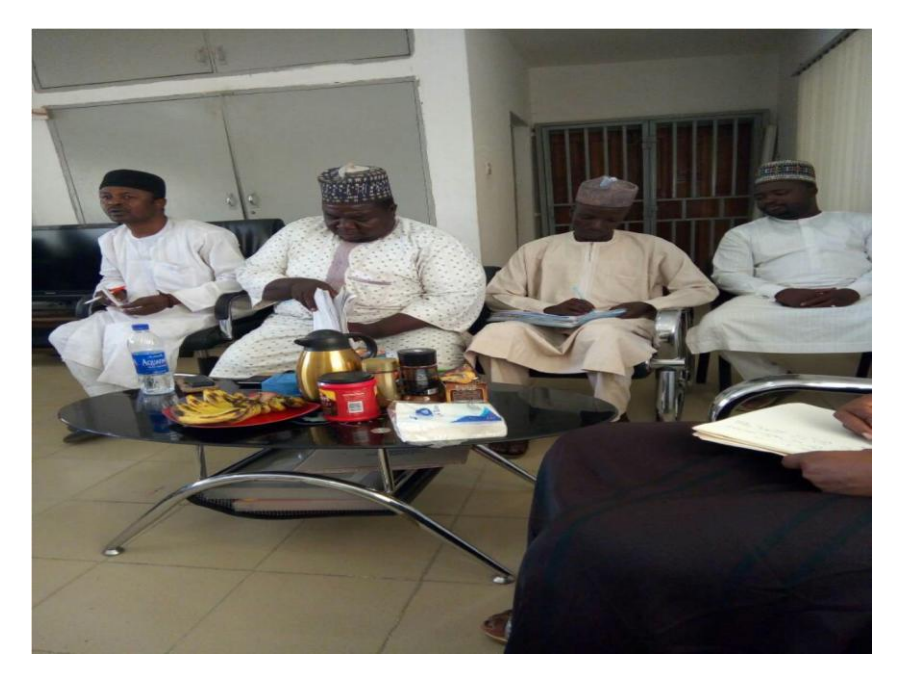
Some of the CSOs that interacted with the Committee