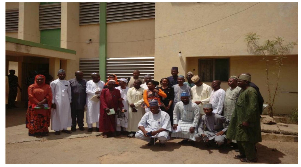
Some representatives of the media organisations that interacted with the Committee

Interaction with Media:- <a href="https://youtu.be/MQgqYYlcwNo">https://youtu.be/MQgqYYlcwNo</a>