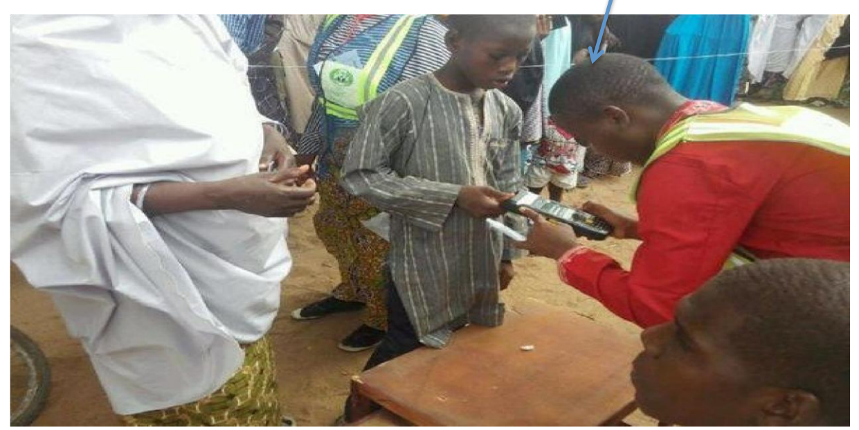
Daily Nigerian 13 February, 2018

https://dailynigerian.com/inec-no-hand-age-voting-videos-images/