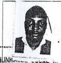
UHUNMWODE LOCAL GOVERNMENT EHOR