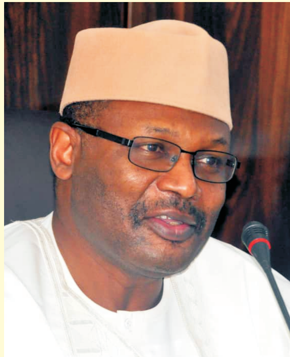
■ Prof. Yakubu, INEC Chairman

opens, Nigerians who are 18 years and above and have not registered, or registered voters who have had any problem during the accreditation in past elections with either their Permanent Voter Card's (PVC) or finger prints not being read by the Smart Card Reader (SCR), can walk into any of the designated centres to get registered.