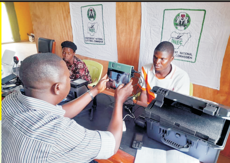
■ Capturing a Registrant in Akure, Ondo State.

That pattern seems to be on its way out if early statistics of the ongoing CVR holds out. For the first time in as long as can be seen in INEC records, the figure posted by youths as prospective voters is not only encouraging, but is indeed outpacing the registration figure of the age brackets above them. As of Monday 8th August 2021, the total number of fresh online pre-registrants stand at 1,609,981 while 195,591 citizens have completed their physical registration. On both scores in terms of online registration and physical registration, the response by eligible persons has remained impressive. 75,116 persons applied