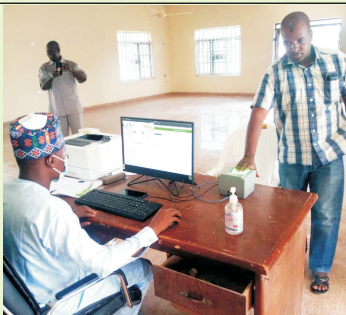
■ Registering a voter in Damaturu, Yobe State.

The statistics also indicate that of the total number of those who have registered, 22,941, persons have indicated one form of disability or