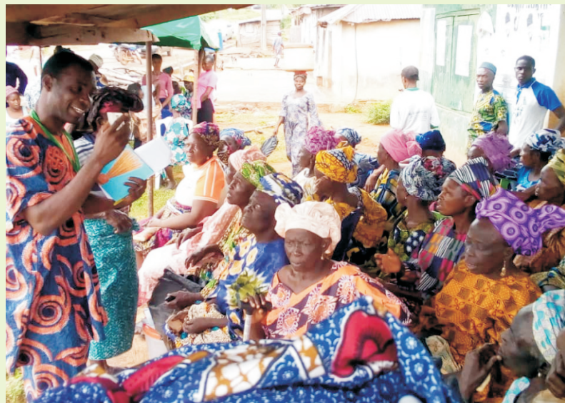
■ Canvassing to women to register at Remo North LGA, Ogun State.

through the online registration route for the week in review while 120,475 went through physical registration.