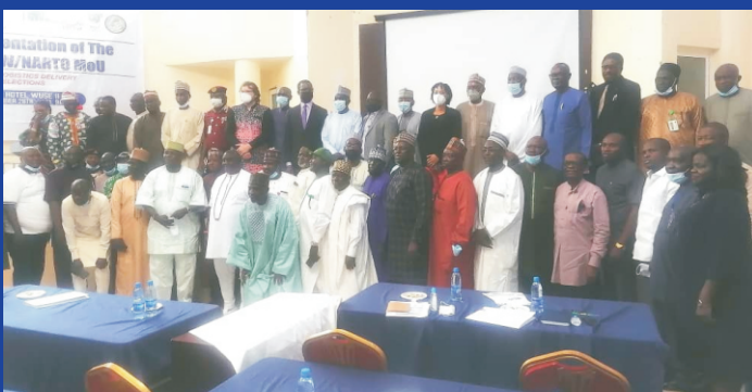
■ Participants at the Review meeting of the implementation of the MoU between INEC/NURTW/NARTO during 2019 General Election held on September 28, 2021 at Barcelona Hotel, Abuja.