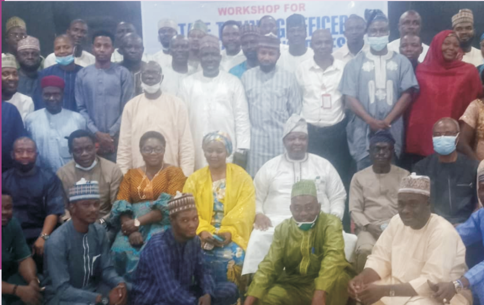
■ Participants at the workshop on training of State Trainers on BVAS

The Independent National Electoral Commission (INEC), in collaboration with the United Nations Development Programme (UNDP) organised a 4-day training of State Training Officers (STOs), The Electoral Institute (TEI) and selected Staff of the ICT on the use of Bimodal Voter Accreditation System (BVAS) for Voter Accreditation ahead of the November 6, Governorship election in Anambra State.